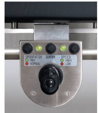
Joy Stick Controller